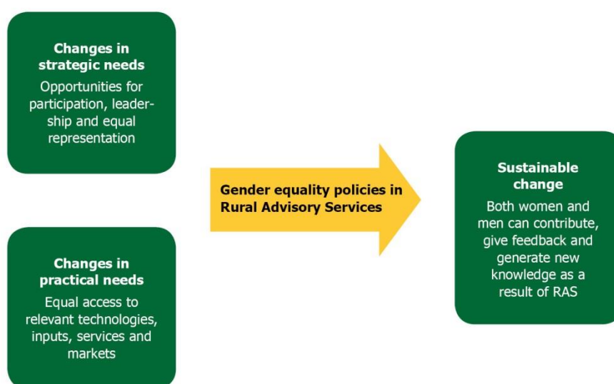
Figure 2. Route to sustainable change in gender equality

Many interventions in RAS have targeted women’s specific practical needs for a specific period of time and have resulted in practical benefits for women in that period. However, looking beyond these interventions, it is striking that a major issue constraining gender equality in agriculture is the lack of sustainability when it comes to up-scaling/mainstreaming the concept of gender equality beyond the specific project interventions. The present paper seeks to provide insights and advice for policy makers and extension organisations that go beyond specific gender project interventions and pursues sustainable changes in the policies, regulatory framework, organisational structures and practises that can effectively support empowerment and equal opportunities for rural women. As figure 2 illustrates, this cannot be achieved only through changes in practical needs for the rural women but requires structural changes in attitudes and power relations in the whole organisational setup that will change women’s by ability to participate in setting the agenda and making decisions for the rural advisory services that will contribute to ensure its relevance to both women and men.